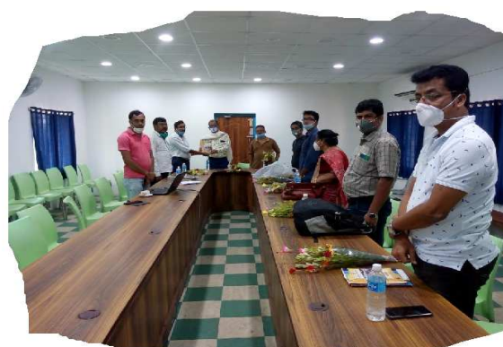
GB Meeting on 17/7/2020